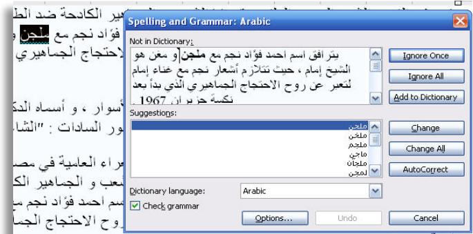
Spelling and grammar checking

Accurately processing Arabic grammar for Western language use presents enormous challenges. After spending a decade developing our proprietary Natural Language Processing system, we have created the most accurate and reliable grammar checker available today. This is the first grammar checker that enables users to properly process modern standard Arabic, based on a syntactic model that was designed and built using our own comprehensive corpus. For faster, easier grammar checking and revisions, AGRAC automatically corrects common grammatical mistakes.